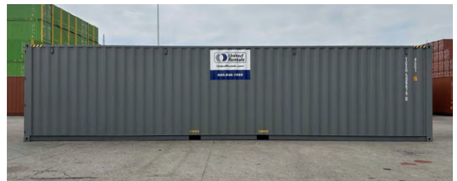
A brand new 40GP at the Yantian factory

of our growth strategy at United Rentals is developing true partnerships with not only our customers, but our vendor network as well. Through honest, transparent communication, Touax Container has earned our trust over the last 8+ years giving our team confidence that the Touax Container team will always do what they say they will do. Without trust there can never be a true partnership, which is what United Rentals and Touax Container have developed."