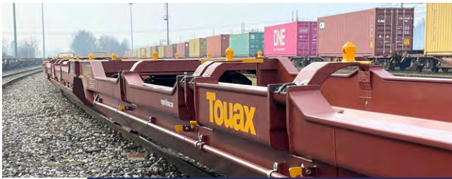
Pocket wagons for transport of semi-trailers

“ Touax Rail is constantly enlarging its wagons’ range ”