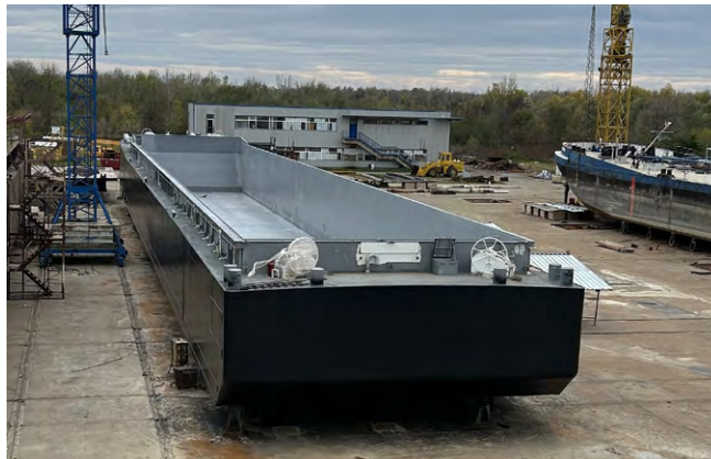
The new Touax 195 under construction

These barges will be used to transport mainly raw building materials and excavated materials for the Grand Paris Express projects, which include the construction of new metro lines in the Paris area. The fleet operating on the Seine will be thus increased to 23 vessels.