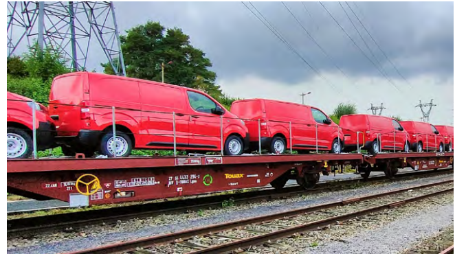
Twin wagons for transport of large vehicles

In 2024 we have already secured the delivery of 5 sets of Twin wagons and have the capacity to offer 3 additional sets for 2025.