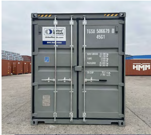
Customised United Rentals Containers

This partnership exemplifies the trust and synergy between Touax Container and United Rentals , driving mutual success and growth in the container solutions market.