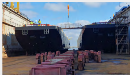
EBK 504 and 501 in dry dock for overall verification

Our partnership with Şantierul Naval Constanța has allowed us to finalize already five out of our seven barges, in a record time of two weeks for two barges. The two remaining ones will be done in the first trimester of 2025.