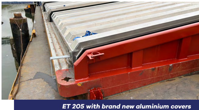
ET 205 with brand new aluminium covers